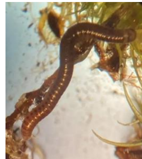
Figure 1. Our new friend, Albert!

enjoyed free time in the playground and cimbea and playea with joy. We also took water samples back to the classroom where we looked for microorganisms. We found only one, we named him Albert.